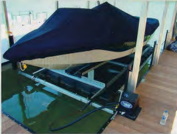
4G Four Corner