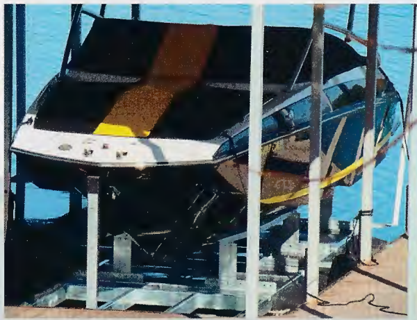
4G Front Mount

Tanks are securely mounted with precision-fit security eliminating the majority of steel in the water