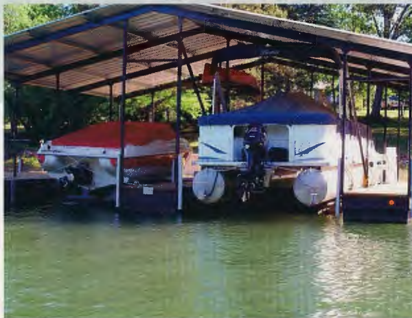
Boat, Pontoon, or Dual Set-ups